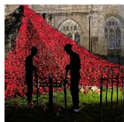
As ever, Callington & District Twinning Association attended the Remembrance Parade recently and laid a wreath at the war memorial.

Guipavas has provided a much more positive response and feels it right to celebrate our special birthday.