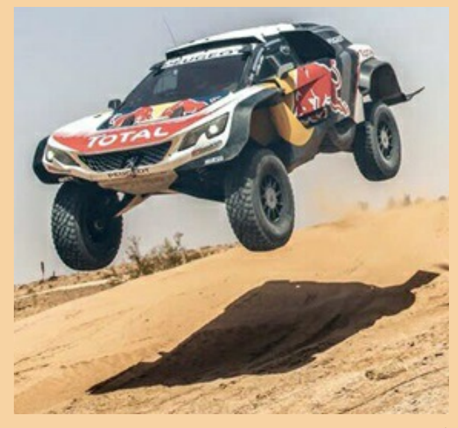
WELL DONE, LESLEY!